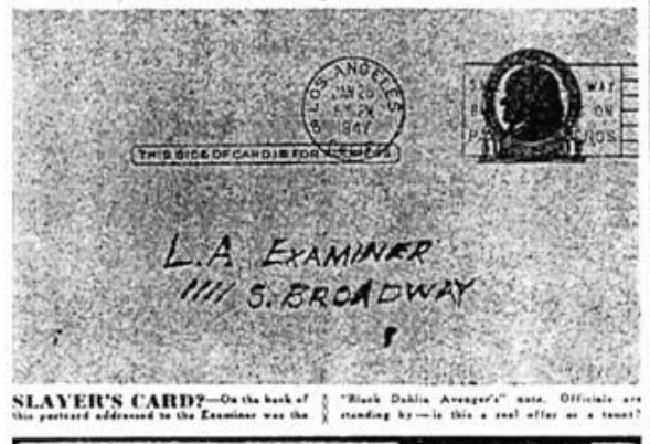
SLAYER'S CARD? —On the back of "Black Dahlia Avenger's" note. Officials are standing by—is this a real offer or a taunt?