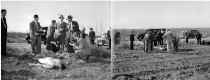
Jeanne French crime scene 11 February 1947

Victim's nude body found in vacant lot 12 kilometers directly west and just 25 days after "Black Dahlia" murder