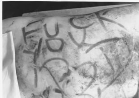
"Fuck You B.D." Written in red lipstick