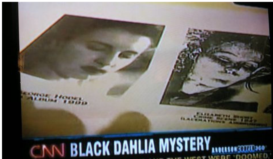
On air comparison of known Elizabeth Short crime scene photo to photo found in George Hodel's album of loved ones.(Facial lacerations and trauma to forehead seen in crime scene photo are covered over by author)