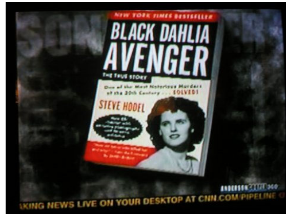
National live interview with author