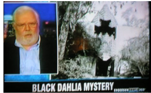
Hollywood Hodel residence, "Franklin House"