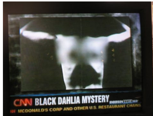
Anderson Cooper and author discuss Man Ray & Surrealism linkage to Black Dahlia case