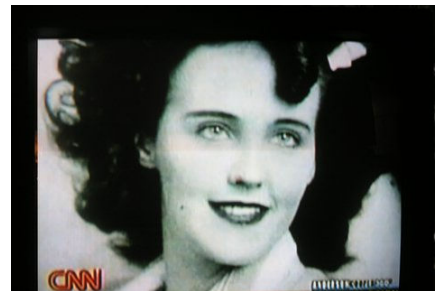
Photo Elizabeth Short circa 1946